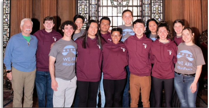
Last year's Elk Scholarship trip to Chicago

Elks Scholars are all the current college students from all over the country who have received an Elk's Scholarship. These are some of the brightest students in the nation, and the one thing they all have in common with the Elks is the desire to give back.