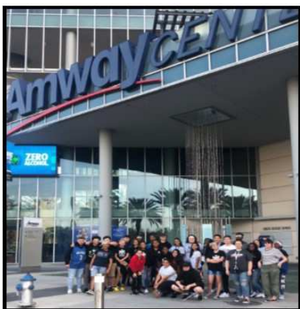
Club Chivalry Field Trip to Orlando