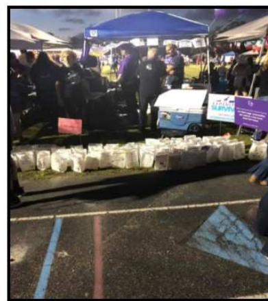
Luminares At Relay for Life 2019