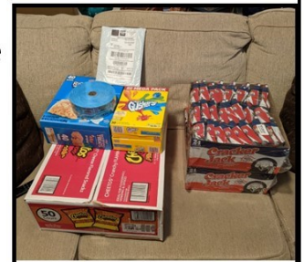
Requested Meeting Supplies