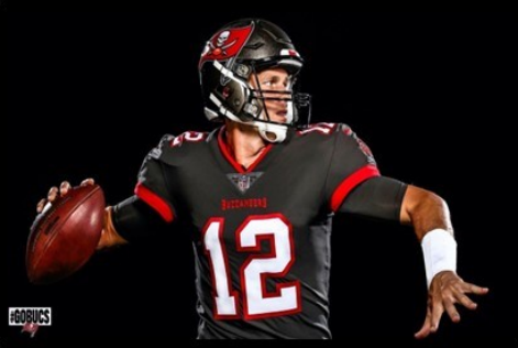
Tampa Bay's Tom Brady