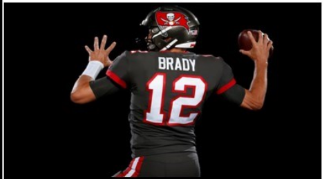
Tampa Bay's Tom Brady

Sunday Dec 27th TBA Lions Vs Buccaneers Detroit Style Pizza Tailgate Free Cheese Kurls at Kickoff Drink Special: Apple Cherry Bomb