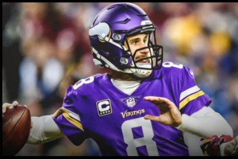
Minnesota's Kirk Cousins

Sunday Dec 13 1:00 Vikings Vs Buccaneers Minnesota style "Hot Dish" tailgate at halftime Onion Dip with chips at kickoff . Drink special: Minnesota Bootlegger