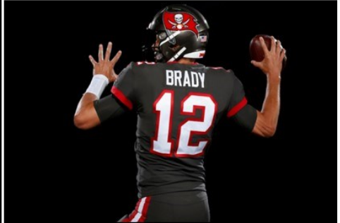
Tampa Bay's Tom Brady

Sunday Dec 13 1:00 Vikings Vs Buccaneers Minnesota style "Hot Dish" tailgate at halftime Onion Dip with chips at kickoff . Drink special: Minnesota Bootlegger