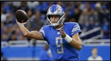
Detroit's Matthew Stafford

Sunday Dec 27th TBA Lions Vs Buccaneers Detroit Style Pizza Tailgate Free Cheese Kurls at Kickoff Drink Special: Apple Cherry Bomb