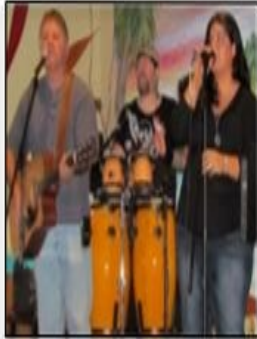
Delirious - June 1st