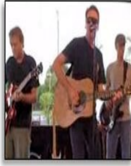
Morris Code Band - June 15th