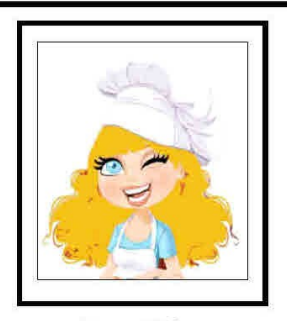
Your ER's Specialties Night November 4th - 6:30 to 8:30