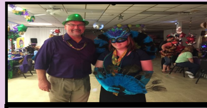
Best Male & Female Costumes