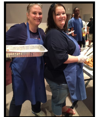
Open Arms Ministry