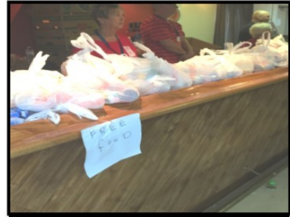
Non perishable food for distribution