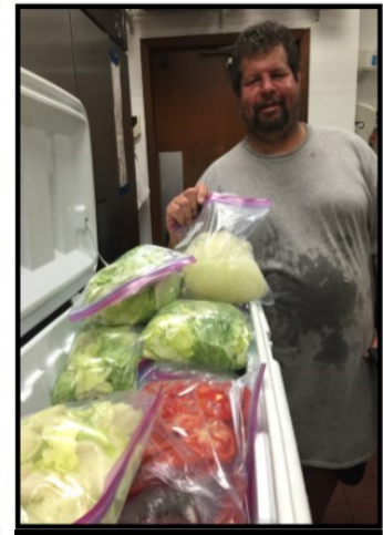
Albi sliced the burger toppings