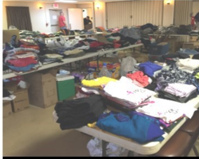
ALA donation room 8 AM