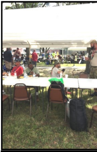
Hotdogs and Hamburgers