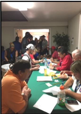
The VA screened the Clients