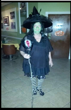
Halloween - 1st place

What a wonderful time we had at the “ Halloween at the Disco ” fundraiser party. The decorations, music, and raffles were just fantastic thanks to a very hardworking and dedicated committee. The dinner was absolutely delicious and fun was had by all. I couldn’t believe that out of 100 people in attendance that about 90 were dressed in a costume of some sort. The Disco theme and music added an additional zing to the event and we achieved our ultimate goal which was to have fun and make some money for our lodge.