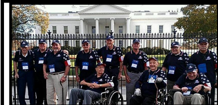
Florida WW II Vets at the White House

Warning - Charity work can be addicting!