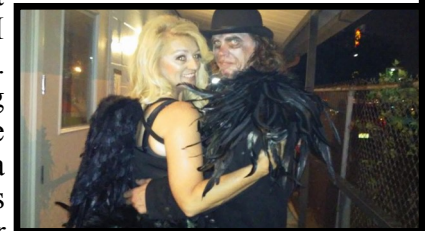
Bartender with Halloween 2nd