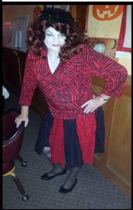
Combo - 1st place