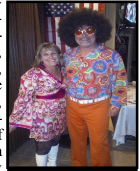
Disco - 1st & 2nd

I want to thank the following Committee Members who helped by either selling tickets, donating decorations, loaning decorations, decorating the glass showcase / lounge and bar area, decorating the back hall including the tables, graveyard and black spider web wall, color printing of advertisement flyers and tickets for free, laminating the flyers, processing advertisements for the Elksize, donation of tablecloths, food preparation, store runs, food donations, setting up tables and chairs, dessert table, auction tables, DJ table, decorating the tables, hanging decorations, being the greeter to the Disco, running the auction table, selling 50/50 tickets, serving and bussing tables, and cleaning up and tearing down the decorations, curtains, tables and chairs. Those committee members who spent a lot of time and worked very hard on this project with me are Shelagh Gombarcik, Melissa Bertoch, Sharon Ford, Bonnie Quire, Brenda Stokking, Wendy “Woo” Weisler, Nancy Keesler, Susie Harlow, Patty Jankiewicz, Betty Gnad and Rita Smith. Thank you all so very much!! You all did such a wonderful job and I thank you for all of your hard work and dedication.