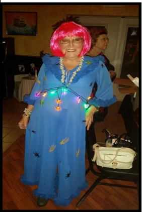
Combo - 2nd place