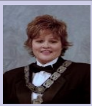
From Your Lodge Secretary:

The members of Tampa Elks Lodge 708 listed below are delinquent to their 2014 - 2015 dues. If you sponsored one or more of them, or know them, please contact them about bringing their membership current.