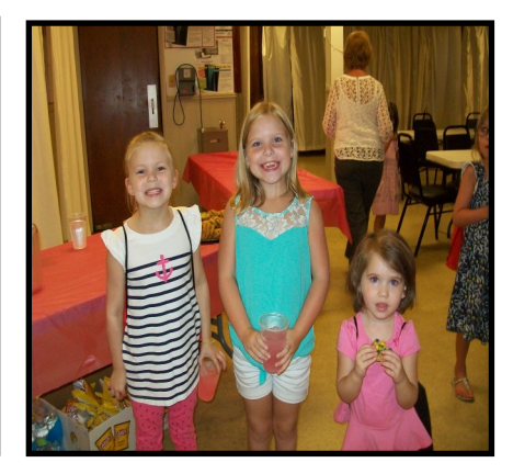
About 35-40 children and their accompanying adult from Big Brothers/ Big Sisters, The Boys and Girls Clubs and the Lodge were fed lunch, entertained by a magician and given school supplies.