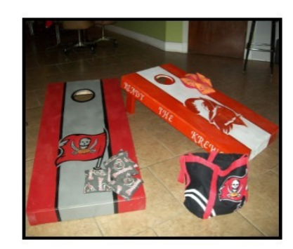
Most sought -after auction item