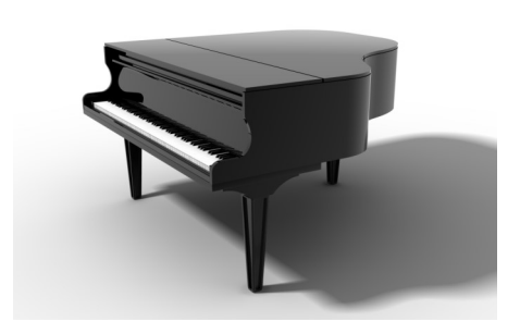
45-50 Elks at the first offering. on April 19 Don't miss the next chance to enjoy this fabulous event!