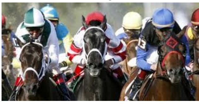
Tampa 708 Elks Lodge May 3<sup>rd</sup> 5pm-7pm