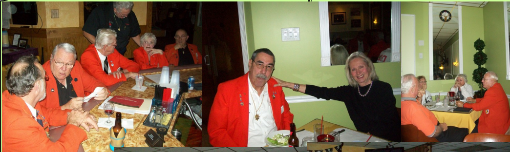
WCD PER Assoc. members held their annual meeting and enjoyed a tasty meal and Fellowship!