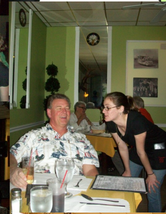
Members and guests enjoy a Friday Night out while pirates and wenches settled into a safe harbor for the 'Gasparella' Invasion