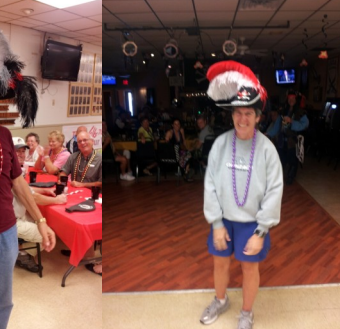
Winner 1 Winner 2 Pirate "Hat Raffle" raised over $300.00 for the lodge. The winners are sporting their new pirate look!