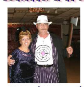
don't axe him anything!