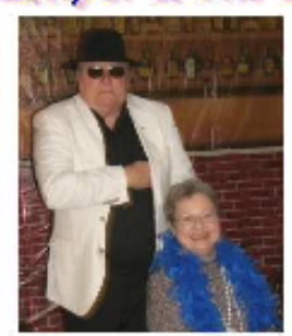
da Godfadder & da Boss