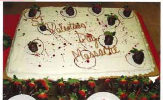
Even the special twin cakes (at right) reflected the theme of the evening and were made of "blood-red" cake! Adding to the fun was a bevy of chocolate-covered strawberries!