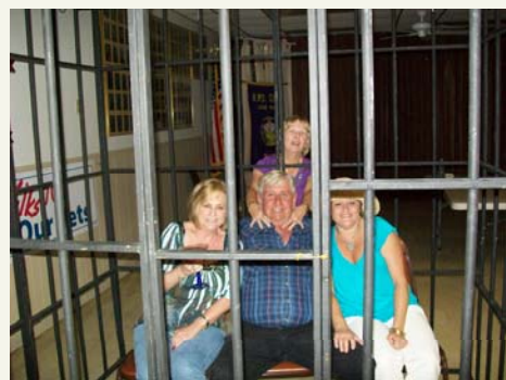
Jailed or Just Visiting???