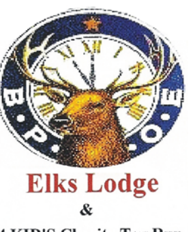
4 KID'S Charity Toy Run