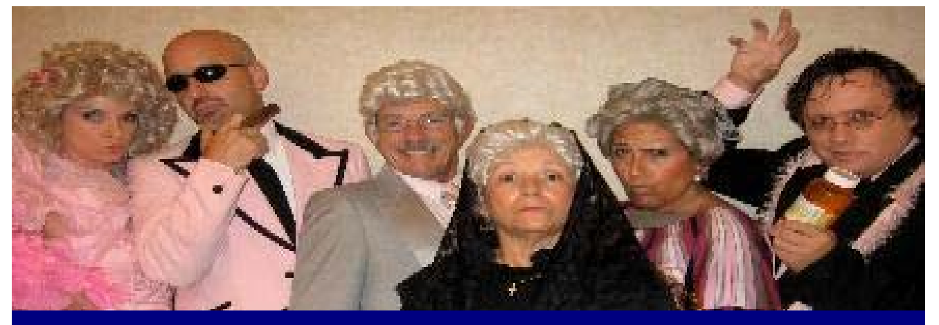
Sponsored by the Tampa Elks Drug Awareness & Youth Activities ** portions of the proceeds also benefit the lodge **